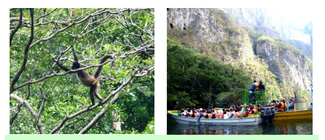
Fig. 10. Spider monkeys of the Sumidero Canyon National Park have adapted in intriguing ways to their environment: they seem to sustain themselves from edible fruits and leaves offered by many plant species in the rainforest patches along the river canyon, breeding success is evidenced by the presence of juveniles and infants in the population, and the tall walls of the canyon seem not to represent an absolute obstacle for individuals spider monkeys to sustain contact with other members of their community.

The Sumidero Canyon is a very important tourist attraction. More than 250,000 tourists visit the park each year [22,19]. While many come to the highest points of the park to view the natural geologic formation, they also visit its interior by boat. The service is provided by an organized guild of boatmen from the city of Chiapa de Corzo, at the beginning of the canyon, who take the tourists along the river where they can view the tall walls of the canyon and also the observable fauna and flora in the patches of semi-evergreen and evergreen rainforest along the river's edge (Fig.10). Tourists can view many birds in these patches as well as the spider monkeys. The charismatic appeal of this primate enhances the intrinsic value of the canyon in the public eye, making the visit more attractive. This raises awareness among the public regarding the importance of preserving the forests and the spider monkeys that exist in the canyon.