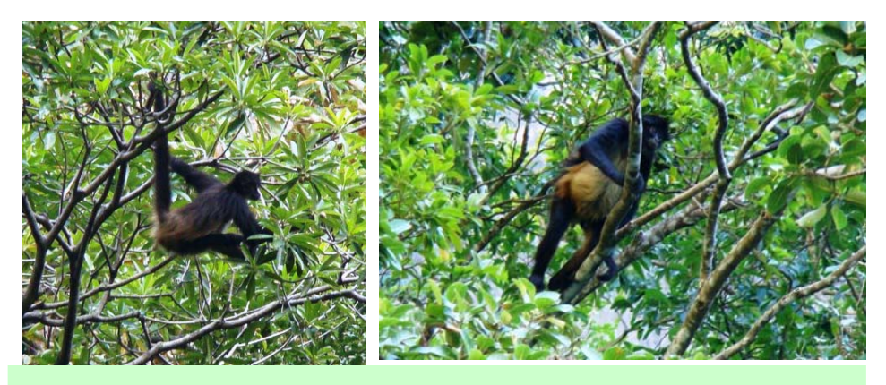
Fig. 6. Two adult spider monkeys feeding on fruits and leaves in one of the rainforest patches by the river canyon.

During the surveys we observed the spider monkeys feeding on the fruits, leaves, and flowers of tree species common in the patches of semievergreen and evergreen rainforest. Some of the tree species used were Ficus spp. and Brosimun alicastrum (Moraceae), Bursera simaruba (Burseraceae), Pseudobombax ellipticum (Bombacaeae), among others (Fig. 6).