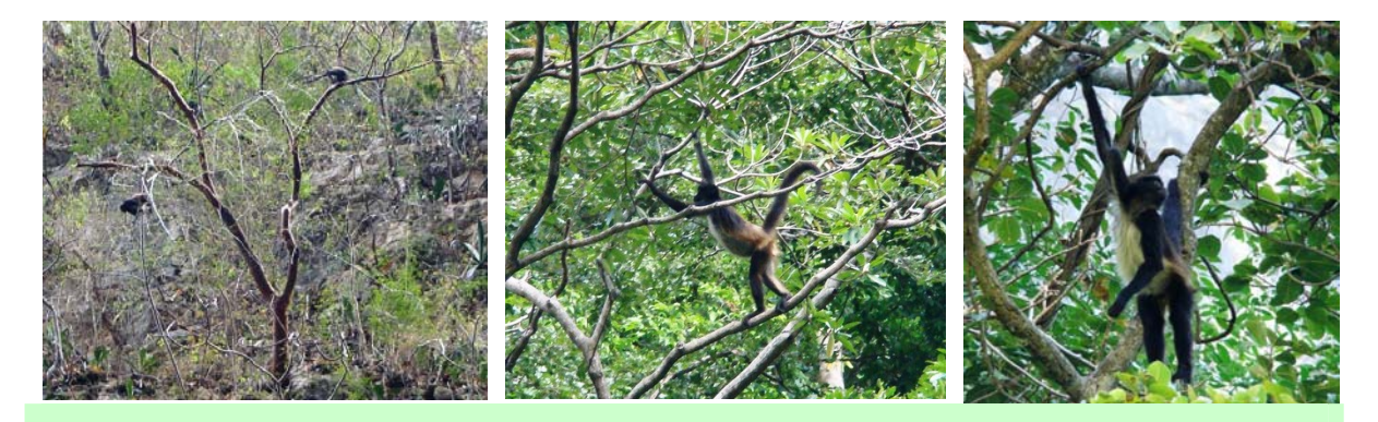
Fig. 5. Left: subgroup of spider monkeys formed by two adults. Center and right: an adult female and an adult male in one of the rainforest patches by the edge of the river canyon.

Twenty-eight percent of the 36 spider monkeys counted were adult males, 36% were adult females, 14% were juveniles males, 14% were juvenile females, and 8% were infants. Relative abundance of spider monkeys along the river's east side (sectors 1-4) was estimated at 1.8 monkeys/km (N/20 km).