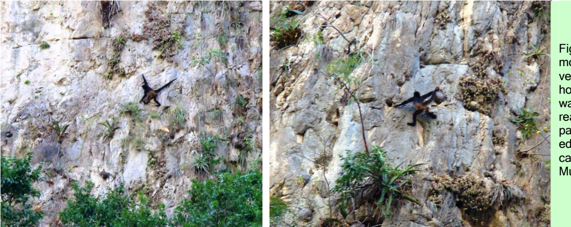
Fig. 8. Spider monkeys moving vertically and horizontally on the wall of the canyon to reach other rainforest patches along the edge of the river canyon.

The patchy distribution of the vegetation suitable for the permanent existence of spider monkeys along the sides of the river canyon may be another factor making detection of the monkeys difficult. These patches are separated from one another by hundreds of meters of rock-solid cliffs (Fig. 7). How do the monkeys move from one patch to another? Our observations indicate they do it by climbing up the cliff and moving along it, vertically and horizontally, until they reach another forest patch (Fig. 8). Such ability probably allows the spider monkeys to sustain themselves in the dry season by exploiting food resources in the several parches of rainforest vegetation available along the river edge of the canyon. In addition, such movements may allow individuals and/or subgroups to meet conspecifics, thus sustaining social and reproductive contacts.