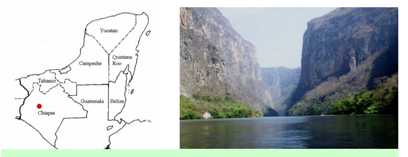
Fig. 1. Left: Approximate location of the Sumidero Canvon National Park in central Chiapas, Mexico. Right: View of of the Sumidero Canyon from a boat. Note the patches of semievergreen and evergreen rainforest at the edge of the river, the low deciduous forest above it, and the steep walls of the canyon.

present there, until now no information was available on demographic features of the population existing in the park. In this paper we report the results of a survey of the population of spider monkeys inhabiting the semi-evergreen and evergreen rainforest of the Sumidero Canyon National Park