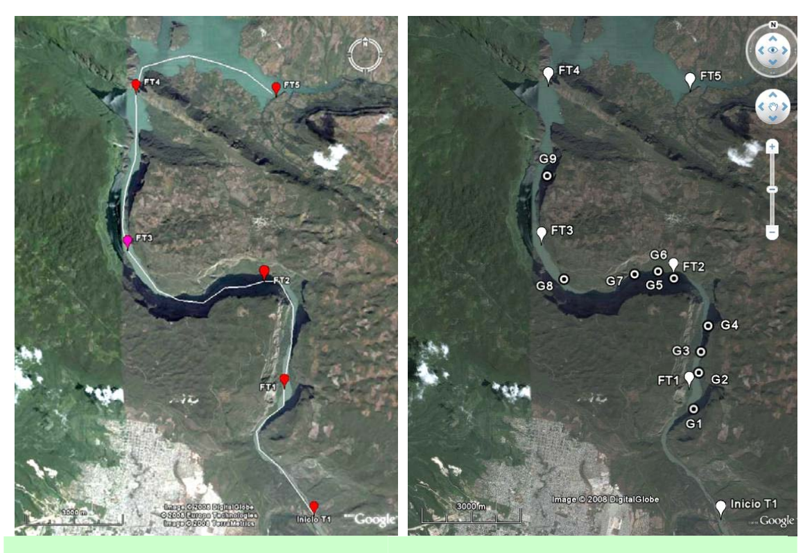
Fig. 2. Approximate location and shape of the five 5km-long sectors (white line) into which the river canyon was divided to survey the spider monkeys from a boat. T1, sector 1; FT1, end of sector 1; FT2, end of sector 2; FT3, end of sector 3; FT4, end of sector 4; FT5, end of sector 5. Image modified after Google Earth

The latter two types of forest vegetation are found in the form of isolated patches along the river and at the bottom of a few ravines flowing from the upper parts of the canyon into the river [19]. Average annual precipitation is 957 mm with a rainy season between May and October. Mean annual temperature is 28.2° C (range 12.6 - 42.3°C). About 60 species of mammals have been identified in the canyon and about 16 species of birds, six mammals, and a butterfly are endemic [19]. Some of the most evident species are the Great Curassow ( Crax rubra ), spider monkeys ( Ateles geoffroyi ), crocodiles ( Crocodylus acutus ), yaguarundi ( Felis yagouaroundi ), ocelot ( Leopardus pardalis ), white-tailed deer ( Odocoileus virginianus ), brocket deer ( Mazama americana ), and tamandua ( Tamandua tetradactyla ), among others.