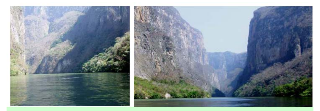
Fig. 7. Patches of rain forest at the edge of the Grijalva River in the Sumidero Canyon. The grayish vegetation above the patches of forest is low deciduous forest. Note the steepness of the terrain where the patches of rainforest are found.

Our brief survey showed the presence of a small population of spider monkeys inhabiting the semievergreen and evergreen rainforest patches present along the edge of the river on the east side of the canyon. Because of the fluid organization (fusion-fission) typical of Ateles and the monkeys' rapid arboreal locomotion, it is possible that we underestimated the actual number of spider monkeys in the canyon. Furthermore, the topographical conditions of the Sumidero Canyon (steep vertical walls) allowed for accurate visual surveys only from the river. The steep terrain decreased our terrestrial mobility, and impeded our ability to track the spider monkeys once they traveled to forest patches that were further from the river and at greater elevation (Fig. 7).