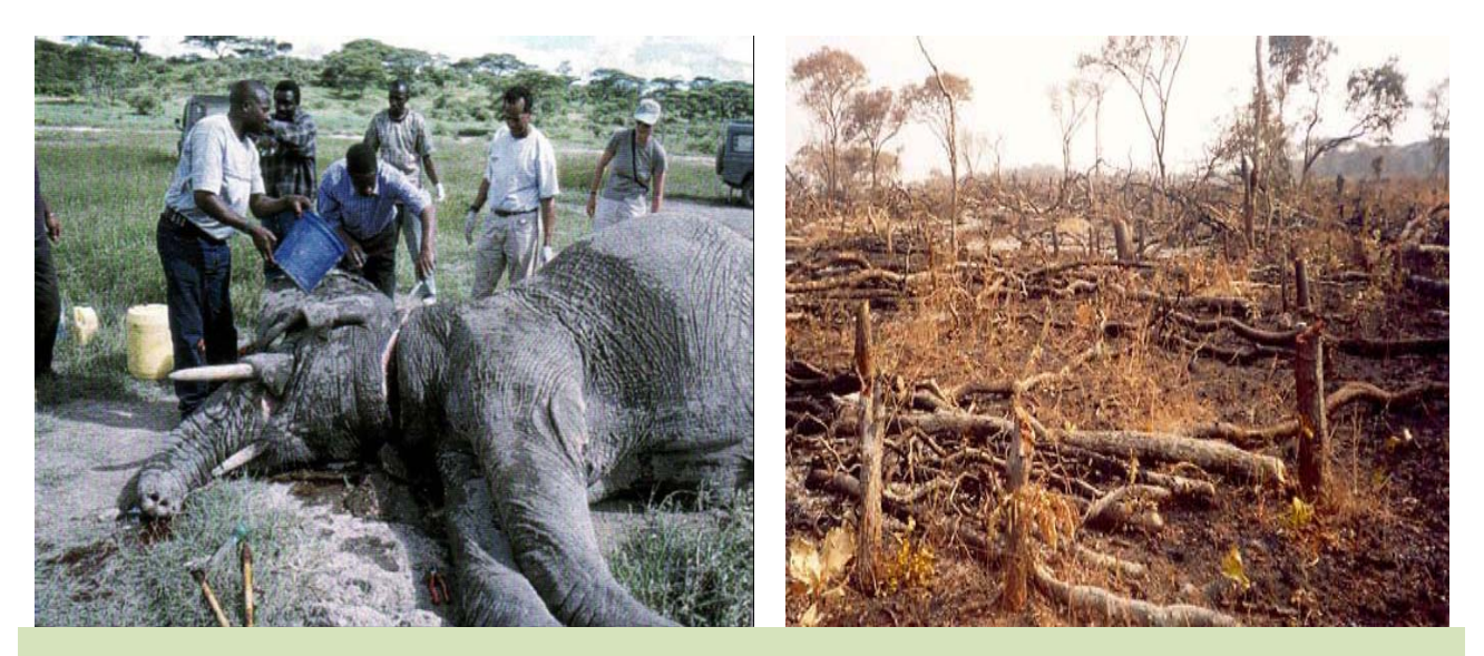
Fig 3: Human Factors in Serengeti: From Left: Effects of illegal hunting - wire snare around the neck of an elephant and Wildlife habitats destroyed for agricultural expansion,

(Kenyan part of the Serengeti ecosystem) between 1977 and 1997 and, consequently, reduction of the wildebeest population by 75%, was mainly caused by the high opportunity cost that landowners would incur by opting for wildlife conservation instead of pursuing mechanized agriculture. The latter was ecologically destructive but economically more attractive to farmers. Its profit was 15 times greater [43]. Furthermore, by virtue of being too minimal, conservation benefits do not contribute adequately to poverty reduction. People's direct dependence on natural resources has therefore remained inevitable.