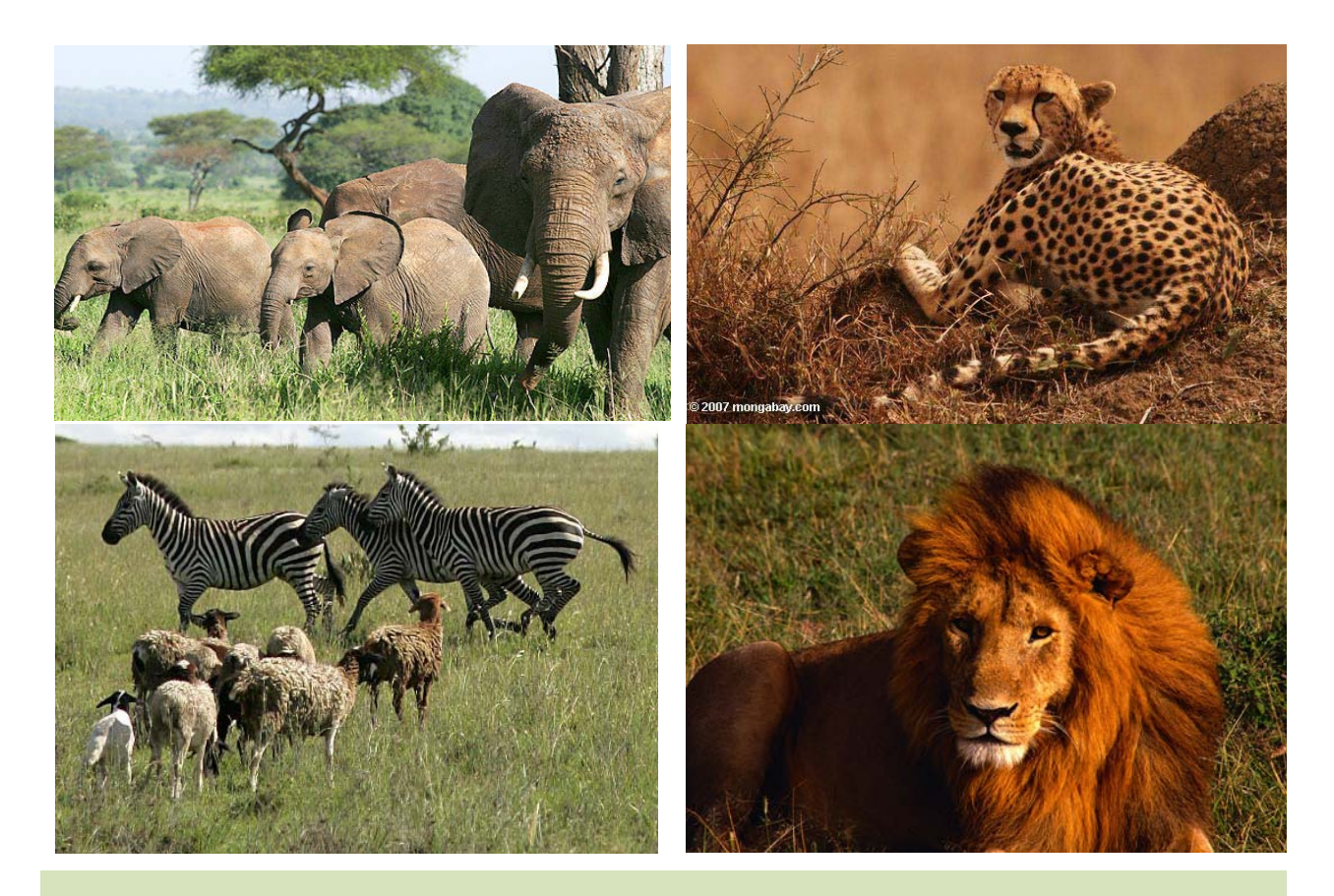
Fig.2. Four of the charismatic wildlife species found in the Serengeti ecosystem: From top left, elephant ( Loxodonta africana ), cheetah ( Acynonix jubatus ), zebra ( Equus burchelli ), and lion ( Panthera leo ).