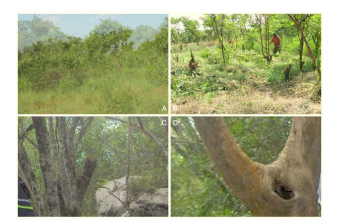
Fig. 1. Kasagala forest reserve – Clockwise from top: (A). Typical savanna vegetation of the reserve, (B). Anthropogenic activities are apparent here – research team inspecting a freshly cleared part of the nature reserve. A few large-stemmed tree individuals are only left at top of Kasagala hill such as these Euclea latidens Stapf (C) and Nuxia floribunda Benth (D).

Previously set aside to provide ecosystem services and offer catchment protection to Lake Kyoga, an inland water body that is gradually drying up due to loss of surrounding vegetation cover [20], this forest is of immense ecological value. Moreover, with a record of high stocks of Combretum trees and the serious threat posed by forest clearance (Figure 1b), this woodland is specifically vulnerable, since Combretum firewood and charcoal are highly preferred by the urban markets of Uganda [21]. Moreover, encroachers are quick to turn parts of the forest into agricultural land, so that only those areas with more difficult terrain retain a reasonable number of larger-stemmed tree individuals (Fig. 1). In view of the above, a study was carried out to investigate the taxonomic diversity and distinctness of the future species in the forest so as to make conservation and policy recommendations regarding the future management of the forest.