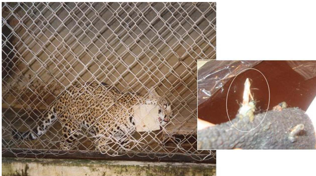
Fig. 2. (a) A jaguar ( Panthera onca ) rubbing against the hairsnare baited with lures at the Tuxtla Gutierrez Zoo in Chiapas; (b) a hair sample obtained from the same jaguar.

(n=1), and jaguarundi (n=1). Other species identified using the hair snares were gray fox ( Urocyon cinereoargenteus , n=1), tayra ( Eira barbara , n=3), coati ( Nasua narica , n=1), four-eyed opossum ( Metachirus nudicaudatus , n=6), and common opossum ( Didelphis marsupialis , n=16). Eight samples were of unknown identity and two samples contained evidence of Mustelids. However, these were excluded due to the low confidence in identification.