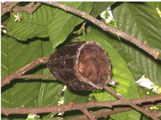
Fig. 2: Evidence of feeding by red-tailed monkeys on the pods on a cocoa tree cocoa in the plantation at Kituza Research Station, Uganda

Red-tailed monkeys in the social group ranged most frequently in plots close to the forest edge, while solitaires ranged more extensively. Hence, cocoa pods in plots near the forest edge were more damaged by social groups than those far away ( r = 0.61 , P < 0.05 , N = 12 plots). Furthermore, plots farthest from the road suffered higher damage than the corresponding plots near the road ( paired t-test = 3.675, P=0.001 ). On the other hand, adult solitary males were sighted more frequently in plots distant from the forest edge ( r = -0.828 , P < 0.001 ; N=12 plots), and consequently, the pod damage caused by solitaires increased with distance from the forest edge ( r = 0.745 , P < 0.008 ).