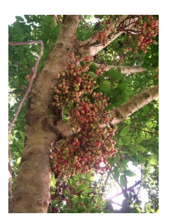
Fig. 5. Important fruit foods for chimpanzees in riverine forest in Bulindi. Left to right: Phoenix reclinata palm with clusters of ripe fruit; cocoa tree in an abandoned forest plantation with unripe pods; fruiting fig tree ( Ficus sur ).