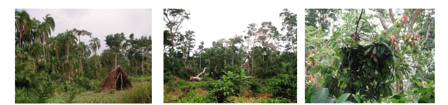
Fig. 4. Some forest types in Bulindi. Left to right: Thin forest dominated by Phoenix reclinata palms growing around a papyrus swamp; degraded mixed forest including trees of Albizia sp., Trilepisium madagascariensis and Funtumia africana (the logged tree in the garden is Antiaris toxicaria ); fresh chimpanzee night nest in a cocoa tree ( Theobroma cacao ) in an abandoned forest plantation.