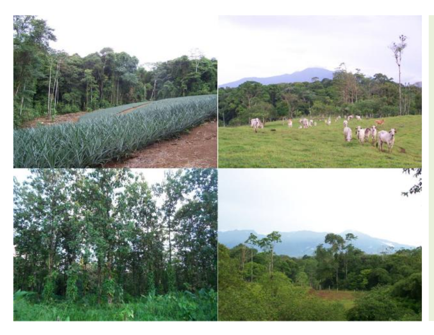
Fig. 2. Four representative matrix land-use types within the San Juan – La Selva Biological Corridor. From left to right: pineapple plantation, cattle ranch, tree plantation, ecolodge reserve.