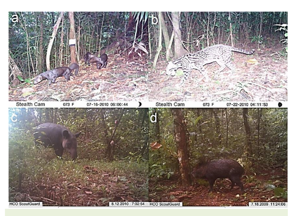
Fig. 3. Photos of two mesopredators, (a) tayra and (b) ocelot, encountered at all four land-cover types, and two large ungulates, (c) Baird's tapir and (d) collared peccary, encountered at land-cover types except pineapple plantations.

It is encouraging that the endangered Baird's tapir was detected at three of the four matrix land-use categories; however, its absence as well as the absence of collared peccary ( Pecari tejacu – Fig. 3) in forests adjacent to pineapple plantations reveals a relative weakness when comparing richness among sites without examining composition. Pineapple production may support many medium mammals, but the fragmentation and edge effects severely limit the habitat for large herbivorous/frugivorous mammals that are often responsible for maintaining natural plant communities [7]. Other influences on herbivores are most likely hunting and poaching pressures. In their study of ungulates in Peru, Licona et al. [32] determined that passive protection from hunters and poachers is mainly due to the inaccessibility of forest reserves. The fragmented nature of the San Juan–La Selva Biological Corridor allows easy access into the forest and may not afford such protection for game species such as collared peccary and paca ( Cuniculus paca ).