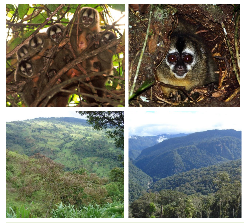
Fig. 3. Clockwise from top left: Study group in vine tangle nest (copyright Sam Shanee/NPC); Adult from study group in nest in hollow tree trunk (Copyright Jean Paul Perret/NPC); Undisturbed forest habitat of A. miconax (Copyright Sam Shanee/NPC); Fragmented forests near La Esperanza study site (Copyright Sam Shanee/NPC).

Our estimate of home range size represents a minimum of the actual space used by this group. For example, on a number of occasions the group was seen to descend to the ground and leave the forest patch to access isolated food sources [23]. On another occasion a follow had to be abandoned after the group travelled past the northern edge of the patch where the ground falls away in a vertical rock face. We could not relocate the group that night and assume they descended the cliff face. How much difference this will make in range size is difficult to determine as resources outside of the home patch are scarce and located nearby. These forays outside of the normal home range are probably necessary for the group to survive in the forest patch. The need to utilize resources outside of the group's home patch could have been necessary because of the unusually long dry season during this study.