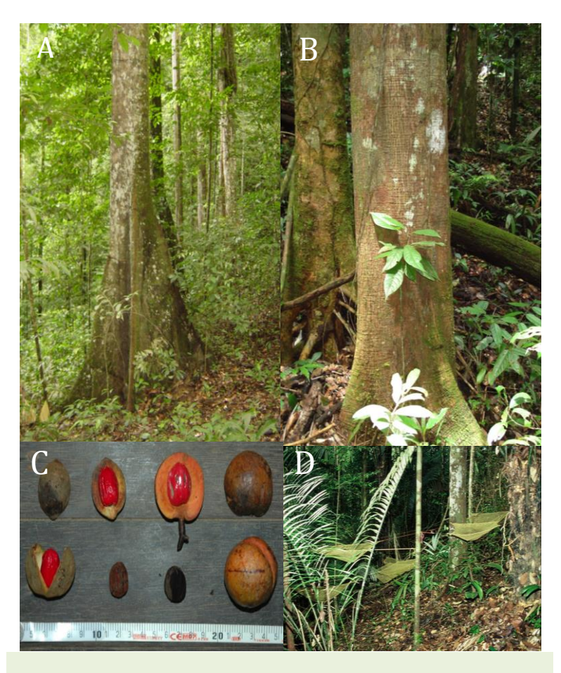
Fig. 2: Virola trees (A : V. kwatae ; B: V. michelii) fruits and seeds (C : V. michelii, left; V. kwatae, right) and litter traps (D) underneath a V. michelii tree crown in Guianan rainforests.

The avian community includes 157 frugivorous or granivorous species. Large canopy frugivorous birds (e.g. toucans, guans) are common. There are 45 species of arboreal and flying frugivorous mammals [49]. Red howler monkeys ( Alouatta seniculus ), capuchins ( Cebus olivaceus and C. apella ) and black spider monkeys ( Ateles paniscus ) dominate in terms of primate biomass.