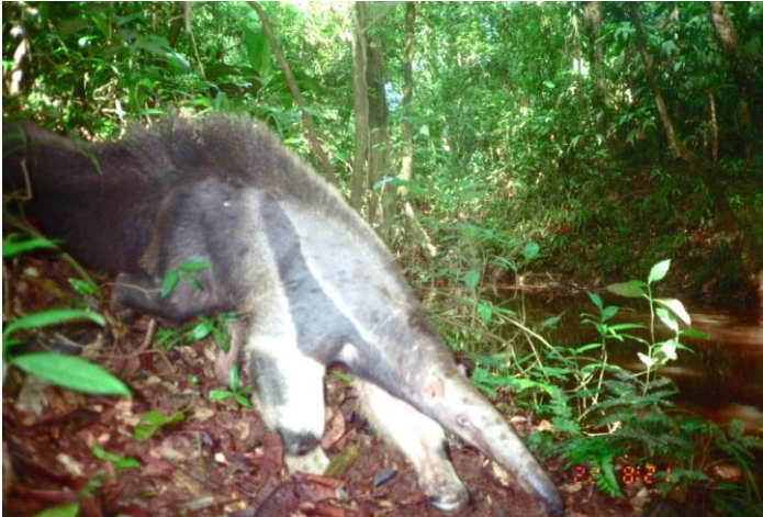
Fig. 2. Giant anteater ( Myrmecophaga tridactyla ) captured on film in broad-leaf forest near the Sikre River.

We expected that the pine savanna would yield richness and capture rates of mammals lower than the forest, but the absence of any captures was unexpected, given the presence of deer tracks and paths throughout the palm thickets where the camera stations were mounted. The lack of captures was probably largely due to the small sample size of cameras placed in the savannas.