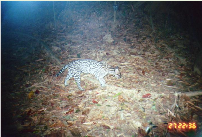
Fig. 4. Ocelot ( Leopardus pardalis ) captured on film in broad-leaf forest near the Sikre River.