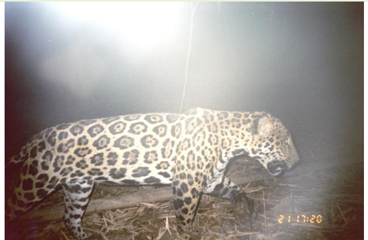
Fig. 5. Jaguar ( Panthera onca ) captured on film in broad-leaf forest near the Sikre River during a pilot study in 2007.