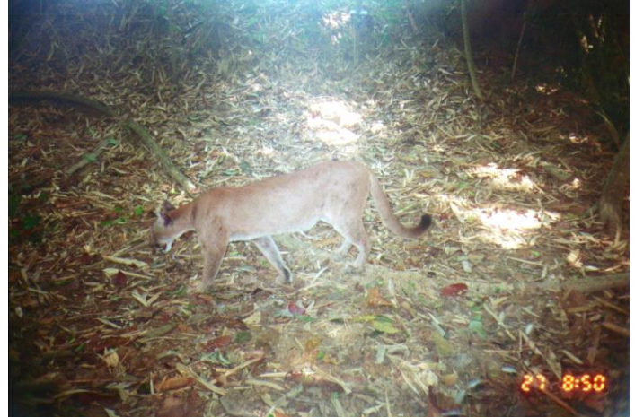
Fig. 3. Puma ( Panthera concolor ) captured on film in broad-leaf forest near the Sikre River.