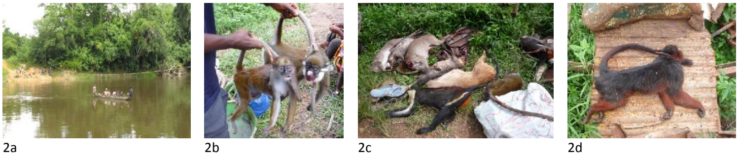
Fig. 2. Images from the Daobly bushmeat market. 2a: Canoe traveling across the Cavally river to the market. Canoes ferry sellers and their bushmeat from Liberia to Ivory Coast. 2b: Olive colobus (left) and Lesser spot-nosed monkey (right) for sale at the Daobly Market. 2c: Collection of animals for sale including duikers, porcupines, Diana monkey, Lesser spot-nosed monkey, and a collection of dried primate and duiker carcasses. 2d: Western red colobus for sale at the market.

During eight visits to the market, we counted 723 animals including 264 primates (Table 2; Figures 2b, 2c, 2d show scenes from the market). Duikers and forest antelope constitute 57% of all meat traded. Of the 264 primates sold, 68% were smoked (i.e., preserved by drying over fire). The most common primate was the Lesser spot-nosed monkey ( Cercopithecus petaurista ) [25%] followed by the Diana monkey ( Cercopithecus diana ) [19.3%]. The least observed primate was the Putty-nosed monkey ( Cercopithecus nictitans ), consisting of a single specimen. The three colobines – Western red colobus ( Procolobus badius ), Olive colobus ( P. verus ), and King colobus ( Colobus polykomos ) – were encountered in similar frequencies, 9.5%, 10.6%, 11.4%, respectively. Two chimpanzees, one freshly killed and one smoked, were encountered and no prosimians were observed during our visits.