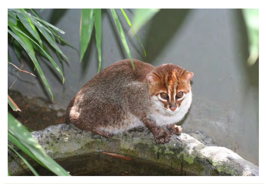
Fig 1. Image of captive flat-headed cat.

A study carried out between 1968 and 1974 [6] recorded that a flat-headed cat had been captured by indigenous people within Pasoh Forest Reserve, in central Peninsular Malaysia. Pasoh's fauna was extensively researched and several other mammalian studies were conducted afterward [7], but there was no further record of this felid species. In recent decades Pasoh has lost many of its large vertebrates, becoming a defaunated ecosystem in which the largest remaining carnivores are the leopard Panthera pardus , sun bear Helarctos malayanus , and dhole Cuon alpinus , all of them probably occurring at very low densities [8]. Increased accessibility from surrounding plantations has presumably contributed to the current strong encroachment and poaching pressure. Here we report the camera trap detection of two flat-headed cats moving together during daytime in Pasoh Forest Reserve in June 2013.