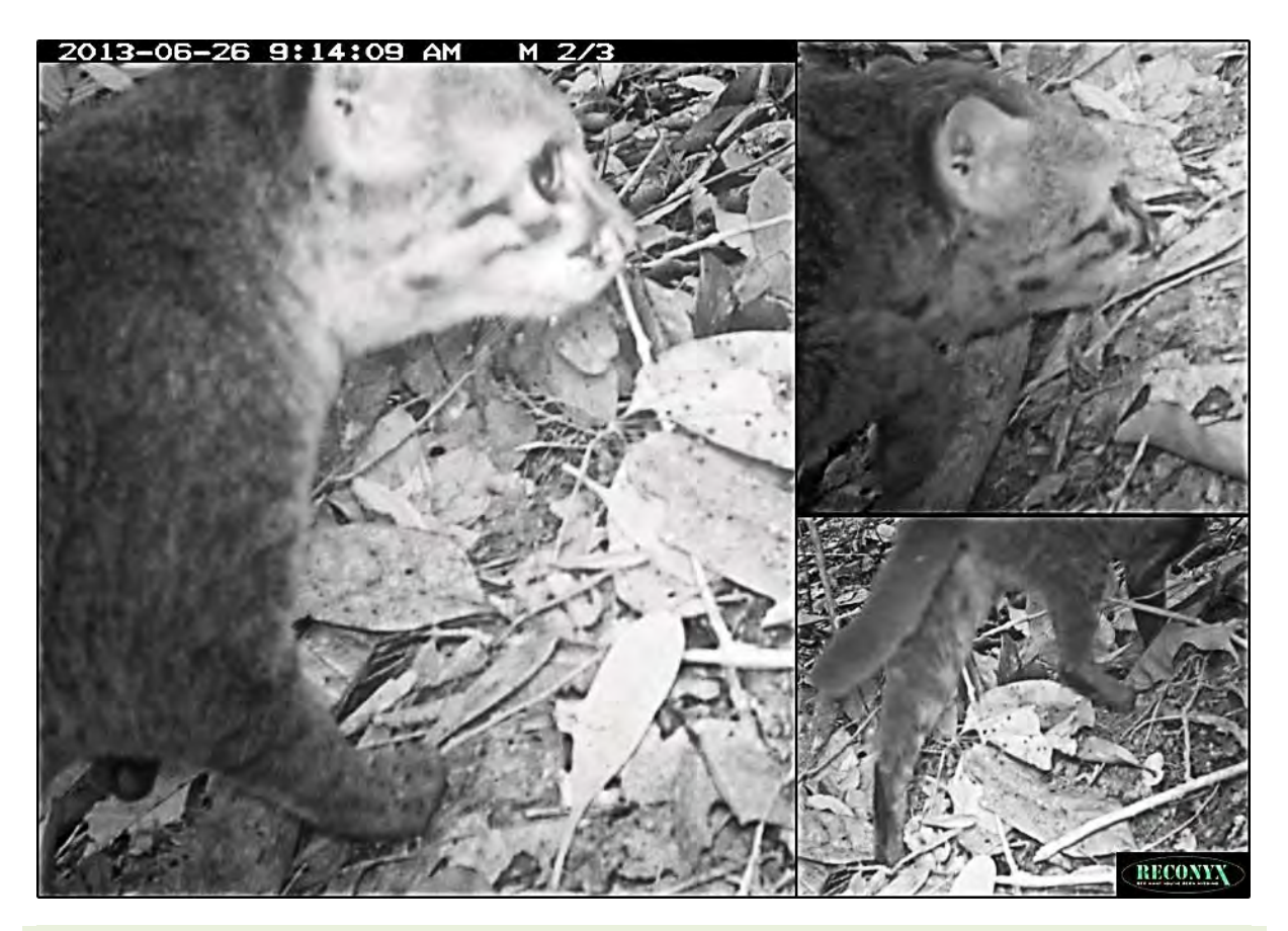
Fig 3. Composite of three camera trap images of one of the flat-headed cats detected in Pasoh Forest Reserve, Peninsular Malaysia, in June 2013, showing details of ear shape and tail.

and Krau Wildlife Reserve [1], all forest blocks of more than 600 km<sup>2</sup>. Pasoh is only a quarter of that size, indicating that this felid species may occur in smaller forest fragments than initially thought.