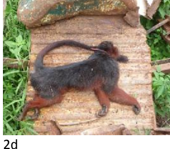
Fig. 2. Images from the Daobly bushmeat market. 2a: Canoe traveling across the Cavally river to the market. Canoes ferry sellers and their bushmeat from Liberia to Ivory Coast. 2b: Olive colobus (left) and Lesser spot-nosed monkey (right) for sale at the Daobly Market. 2c: Collection of animals for sale including duikers, porcupines, Diana monkey, Lesser spot-nosed monkey, and a collection of dried primate and duiker carcasses. 2d: Western red colobus for sale at the market.