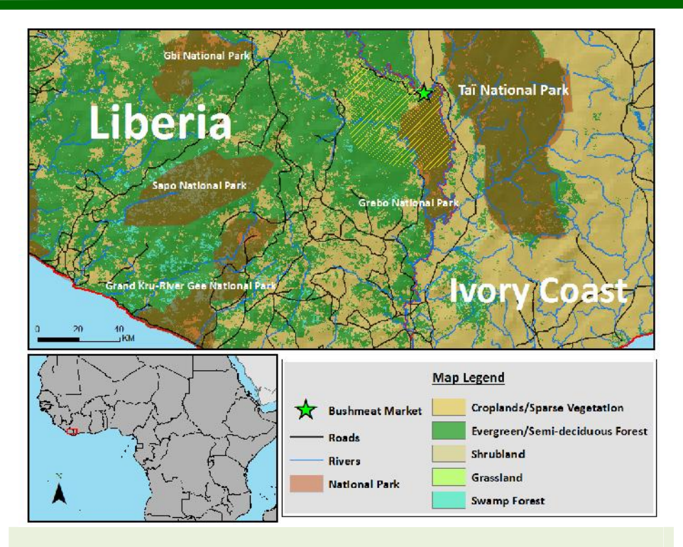
Fig. 1. The location of the bushmeat market along the Ivory Coast/Liberia border. Hunting range indicated by yellow, diagonal lines. Map by R. Covey.

We visited the market seven times on Fridays between May – July in 2009 and once on a Friday in May of 2010, for a total of eight visits. Data collection during each visit began at 10:00 a.m. and concluded at approximately 1:00 p.m. During our first visit, we explained the purpose of our surveys to actors in the bushmeat trade, assuring participants that their identities would not be revealed. We counted all primate carcasses arriving via dugout canoe from across the Cavally River (Fig. 2a) and recorded the date, species, and preservation state (smoked or fresh) of each primate. Determining age and sex was difficult for smoked carcasses and we did not record data on these individuals; however, based on the size of both smoked and fresh carcasses, we determined that nearly all individuals sold at the market were adults. Two assistants from the Taï Monkey Project [21] based in the nearby Taï National Park (Ivory Coast) aided in identifying primates. Smoked carcasses were identified by their size, pelage, distinguishing facial features, and morphology. Two carcasses were burned to such an extent that species identification was not possible and were labeled as unknown.