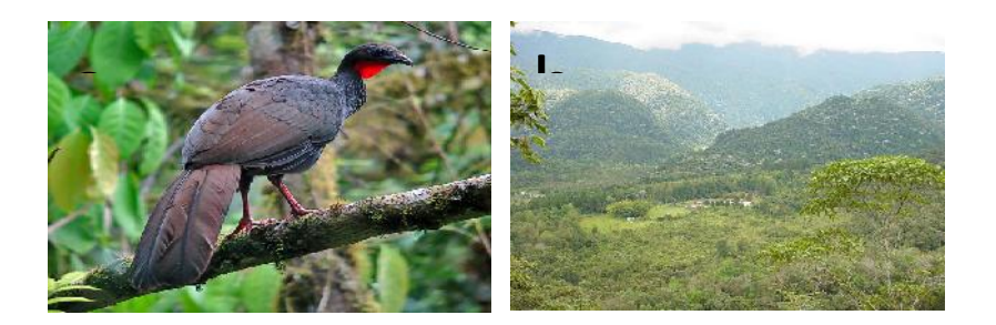
Fig. 1. Cauca Guan, Penelope perspicax ; photo by Pete Morris/Birdquest, with permission (a); Otún River watershed on the Central range of the Colombian Andes, with the Otún Quimbaya Flora and Fauna Sanctuary facilities in the middle; photo by Gustavo Kattan (b).