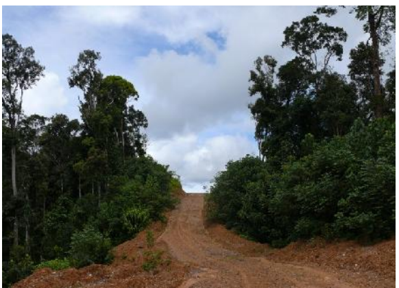
Fig. 2a. The dense cover of Piper aduncum along the old road in southern part of the concession