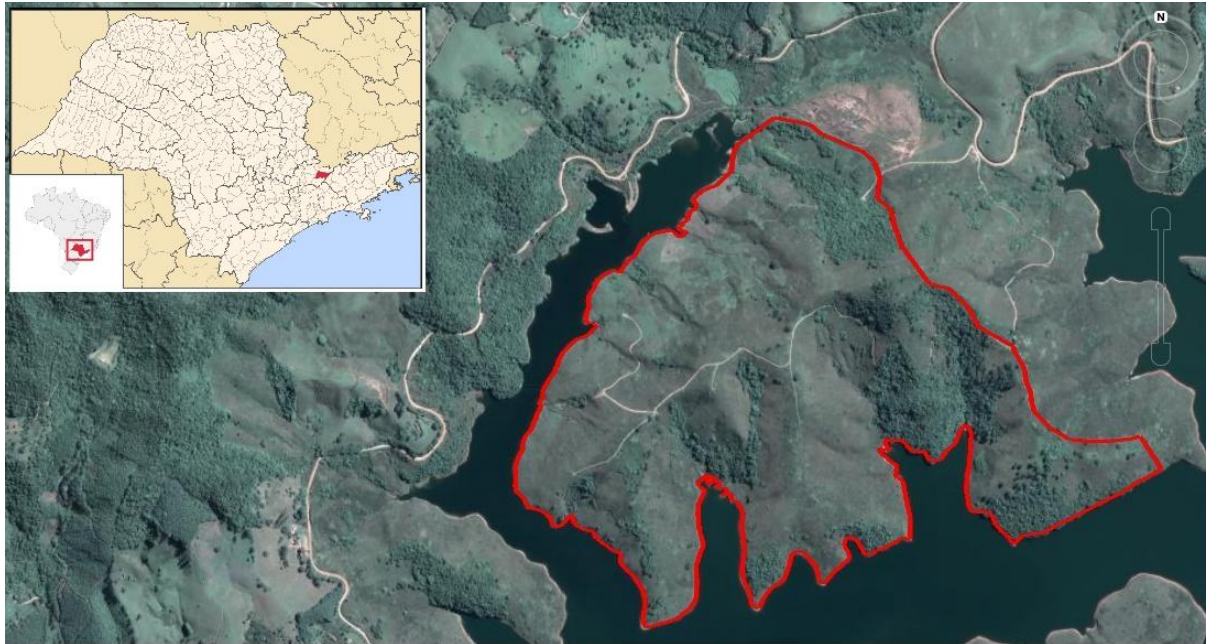
Fig. 1: Location of the study area (upper left corner) and aerial photograph of the 350 ha pasture where this work was carried out.

Almeida et al. [40] reported that 81 (63%) of the 129 bird species in our study area move through open, anthropized, and forest border areas.; additionally, 19% of individual birds sampled and 22% of the bird species in our study area were potential seed dispersers, while 68% of the trees with diameter at breast height greater than 15 cm in forest remnants were animal-dispersed.