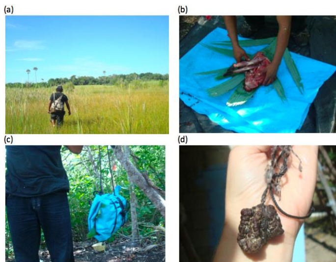
Fig. 2. Images of contemporaneous subsistence hunting in LPBR: (a) Peasant-hunter during an individual hunting trip, approaching a peten in a typical hunting landscape of the region; (b) Peasant-hunter wrapping a small prey in palm leaves and plastic to conceal it and transport it back to the community; (c) View of the prey wrapped and ready for transport by peasant-hunter at the end of his hunting activity; (d) “Deer stone”, the most precious talisman for hunters in the region, due to the quantity and type of prey which provides with.

In both communities ( \chi^2 = 0.02 ; P > 0.05 ), the majority of interviewees expressed enthusiasm for hunting, mainly individually (Fig. 2a), for white-tailed deer. They did not have a preference for a hunting season (especially in El Remate). Opinion was divided among peasant-hunters (ca. 50%; \chi^2 = 0.14 ; P > 0.05 ) about encouragement by their families to practice hunting. In the majority of cases, interviewees perceived a reduction in potential prey (compared to the previous decade) in the vicinity of their community (Table 1).