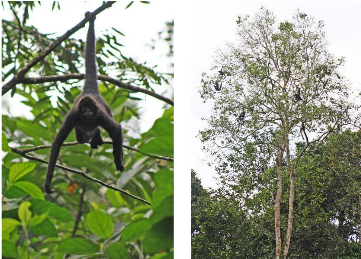
Fig. 1. Female A. f. fusciceps encountered in Cabecera de Pambilar, a 37-ha forest fragment (left), and group of 7 individuals observed in P3, a 35-ha forest fragment (right).

The nine forest fragments where the brown-headed spider monkey was either reported or directly sighted ranged in size from 35 to 1,300 ha; three were less than 60 ha (Table 1). Separated from the nearest surveyed fragment by no more than 9 km and as little as 1.3 km, eight of these fragments (Las Lolas, Cabecera de Pambilar, P1, P3, La Crespa, Mono, Tigra and Rio de Oro) were clustered along the eastern edge of the Jama Coaque Range within an area of approximately 300 km 2 . In an 800-ha fragment known as La Cienega located 30 km farther north, residents reported they had seen the species, but our brief attempt to confirm its presence using playback yielded negative results. Residents living around two of the most isolated fragments surveyed (Ciriaco and Hierbas) claimed they had never seen the brown-headed spider monkey, which was supported by the lack of response to playback at these sites.