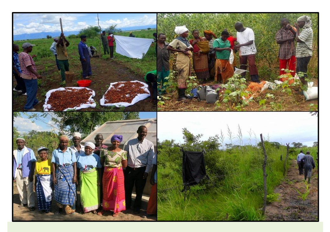
Fig. 1. Chili fences and community-based organizations (CBOs): (top left) a farmer-to-farmer exchange demonstrates chili fences construction; (top right) chili fences are made of locally available and inexpensive materials; (bottom left) the Mikumi Tembo-Pilipili team in front of Africa's first solar chili-dryer made of local materials; (bottom right) a Mikumi chili Mikumi chili fences protecting maize and chili crops.

Between 2006 and 2015, over 800 farmers in high HEC areas worked with the Tembo-Pilipili (Kiswahili for 'elephant-chili pepper') program to construct 110 chili fences of different sizes encompassing roughly 1,174 ha of maize ( Zea mays ), sorghum ( Sorghum bicolor ), and watermelon ( Citrullus lanatus ) fields. In 2015 alone, approximately 70 ha of crops were fenced along the Mikumi National Park border and 65 ha along the northwest border of Tarangire National Park. The Mikumi Tembo-Pilipili team introduced chili fences to farmers around Tarangire National Park in 2015, with one new CBO. A Tembo-Pilipili team was established and multiple fences were constructed.