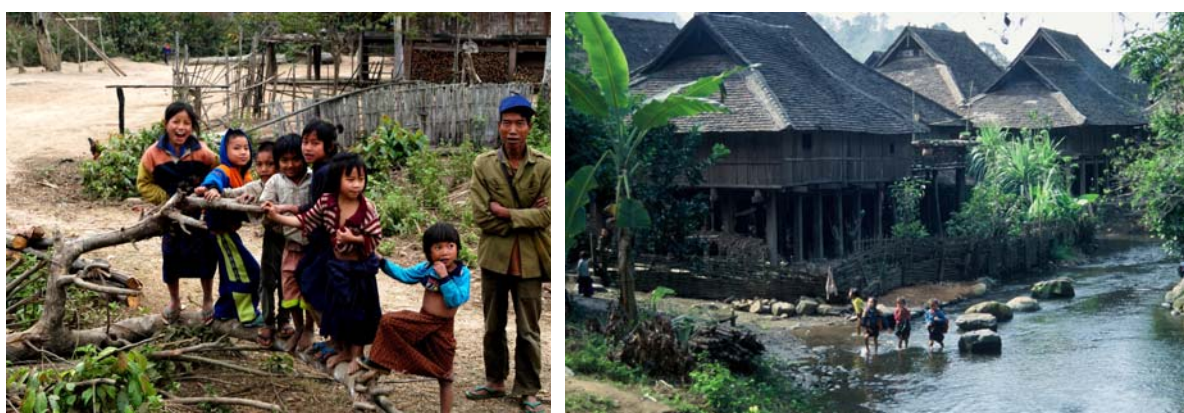
Fig. 3. Left: People of village of Yao. Right: Village and people of Dai. Southern Yunnan, China

A direct land connection between mainland SE Asia and Western Malesia existed until the early Pliocene (5 million years ago) and there was no geographical barrier to natural distribution of plants between mainland Southeast Asia and Western Malesia during most of the Tertiary [30]. The geological history of Southeast Asia could explain the Malaysian floristic affinity of the tropical seasonal rainforest in southern Yunnan.