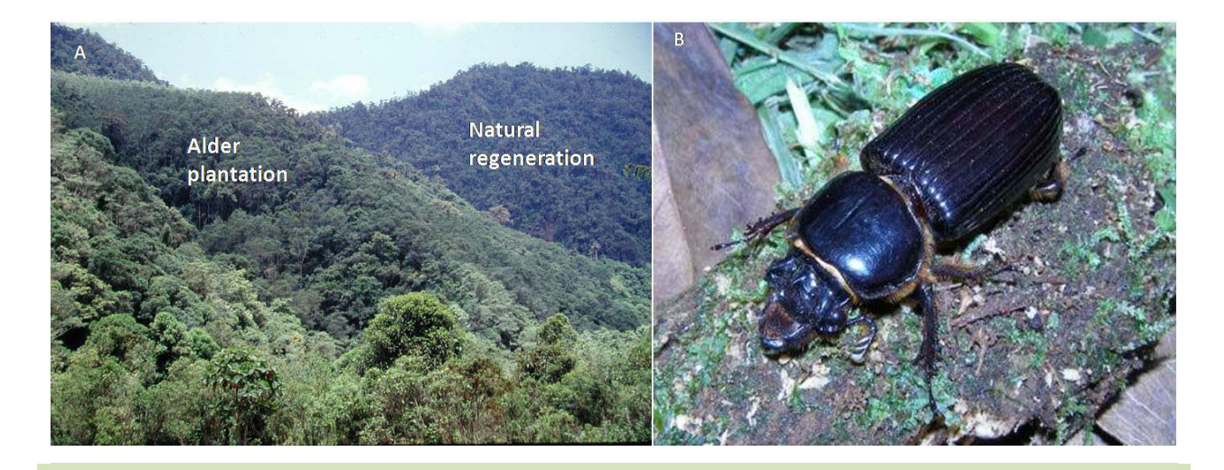
Fig. 1. A. Mosaic of alder plantations and natural regeneration at Ucumarí Natural Regional Park in the Central Andes of Colombia. Note the homogeneous canopy of the alder stand. B. Veturius aff. transversus, a passalid beetle found at Ucumarí.

We conducted this study to ascertain whether, after 40 years, the community of bess beetles had been restored in these forests, and if bess beetle diversity and abundance differed between alder plantations and secondary forest, in particular because of the monodominance and size homogeneity of alder in plantations [5]. We compared the bess beetle fauna of alder and second-growth forest of the same age, with that of old-growth forest remnants, and measured the resource base of fallen logs and branches, as a possible factor determining differences in beetle faunas among habitats.