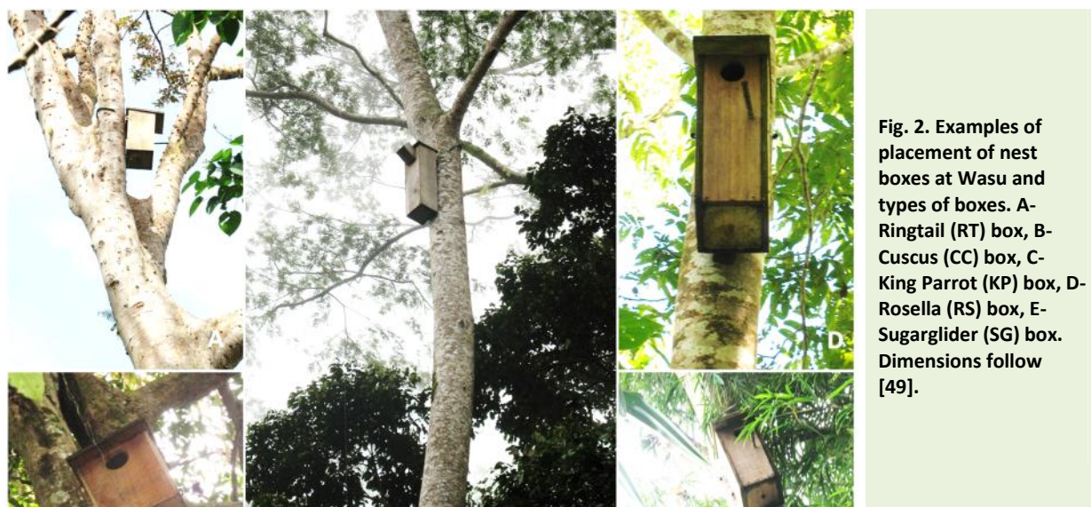
Fig. 2. Examples of placement of nest boxes at Wasu and types of boxes. A- Ringtail (RT) box, B- Cuscus (CC) box, C- King Parrot (KP) box, D- Rosella (RS) box, E- Sugarglider (SG) box. Dimensions follow [49].

Most tests were non-parametric tests, or t-tests for differences of means. Tests were made using online Chi-square test [50]; online Mann-Whitney U-test [51]; and online independent t-test [52].