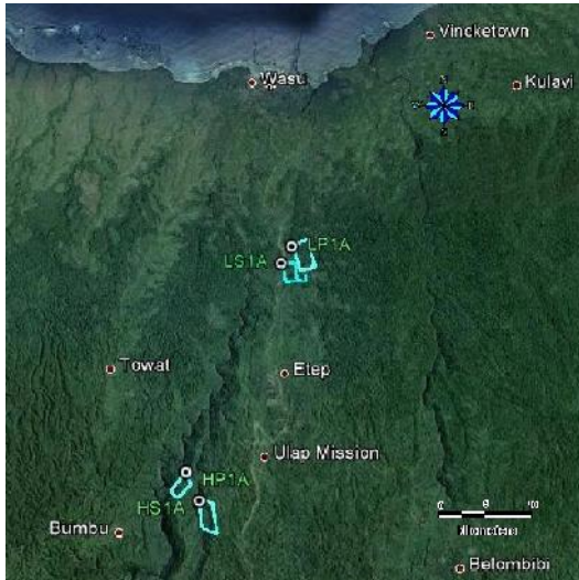
Fig. 1a Location of study areas in Papua New Guinea on the eastern half of the island of New Guinea. Fig. 1b. Detail of the Wasu study area showing the boundaries of the four nest box plots.