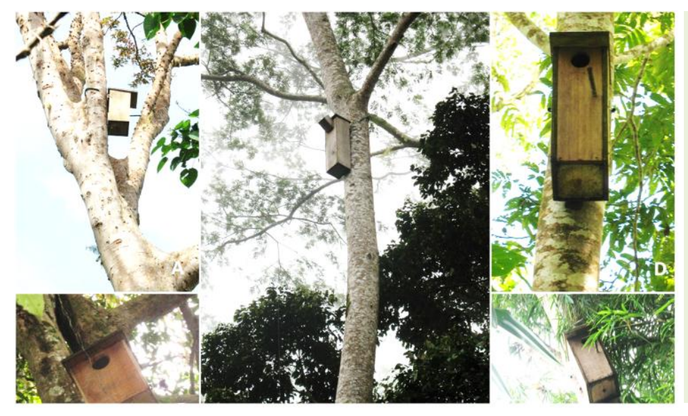
Fig. 2. Examples of placement of nest boxes at Wasu and types of boxes. A-Ringtail (RT) box, B-Cuscus (CC) box, C-King Parrot (KP) box, D-Rosella (RS) box, E-Sugarglider (SG) box. Dimensions follow [49].

Most tests were non-parametric tests, or t-tests for differences of means. Tests were made using online Chi-square test [50]; online Mann-Whitney U-test [51]; and online independent t-test [52].