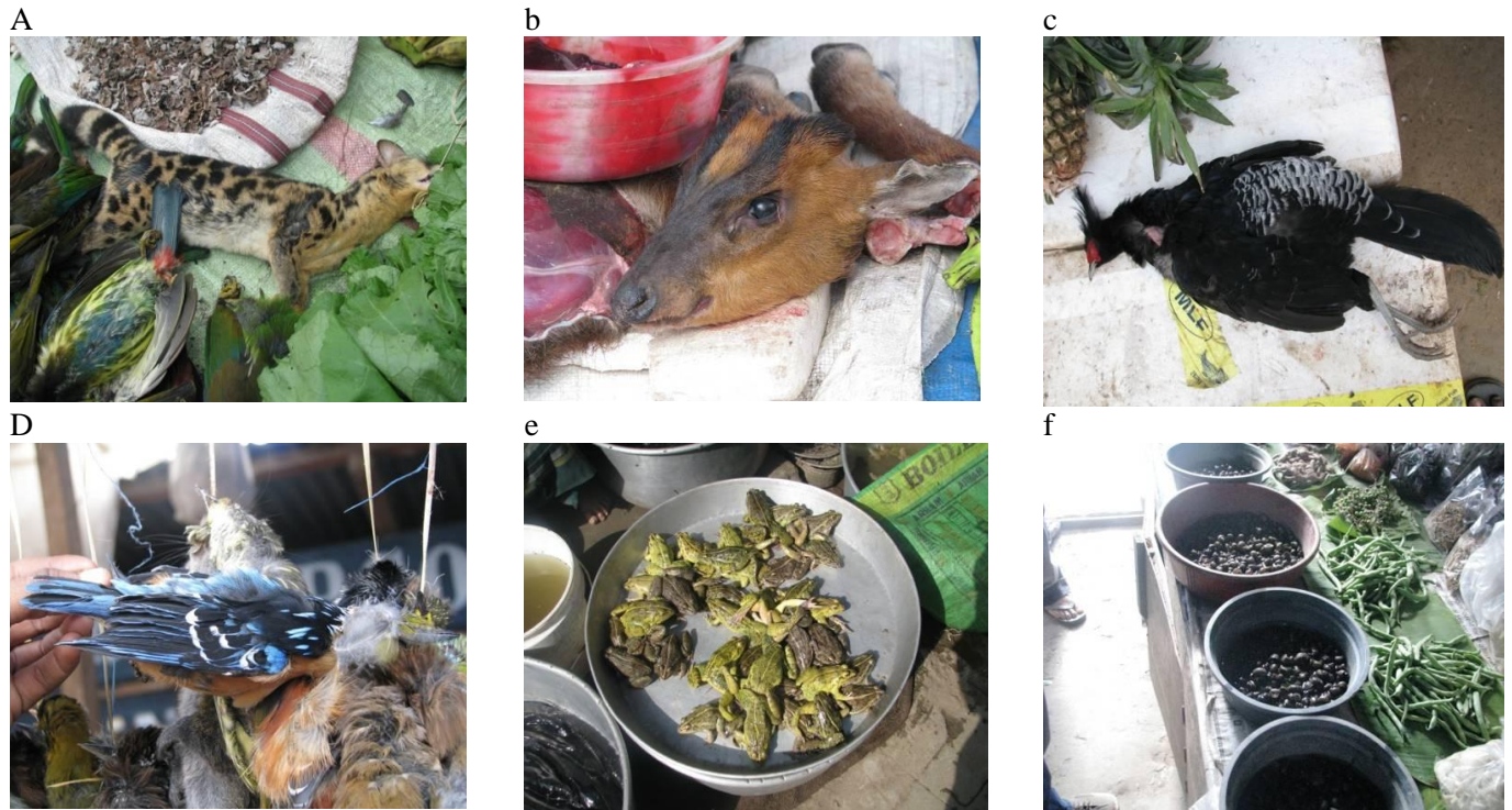
Fig.3. Representation of wild animals sold in Tuensang market, eastern Nagaland; (a) Spotted Linsang Prionodon pardicolor (b) Red Muntjac Muntiacus muntjak (c) Kalij Pheasant Lophura leucomelanos (d) Beautiful Nuthatch Sitta formosa (e) Amphibians (f) Molluscs.

Traditionally, the people of Nagaland largely depend on wild animal meat for their protein requirement. During winter, the temperature of the region dips to < 8^{\circ} C and animal protein is an important and staple food for the local inhabitants. Enquiry among the vendors revealed that the number and diversity of birds and mammals brought to the market declined during the last five years. Culturally important birds such as the great hornbill Buceros bicornis and Blyth's tragopan Tragopan blythii and mammals such as goral Nemorhaedus goral were sold about 5-10 years ago at Tuensang market, but were not observed during this study. Animals sold in Tuensang market were smaller (Table 3) compared to the trophies found in houses. Vendors believed that these animals have been locally extirpated due to over-exploitation and massive habitat destruction. Tribes used catapults for hunting small birds and squirrels and bow and arrows for killing larger mammals a decade ago. Vendors believe that use of air guns and other sophisticated weapons became common in the last 5-10 years. They also revealed that in recent (<5) years, people have switched from consuming wild animals to domesticated animals such as chicken, pig, dog and cattle. However, data on the quantities of these were not recorded during this study.