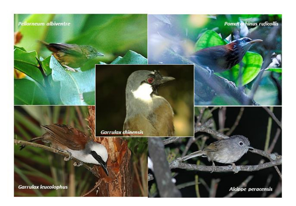
Fig. 3. Species of Timaliiade used in this study.

Another important finding of our study is that only 14-20% of predicted distributions overlap with protected areas, assuming that the land within these distributions inside protected areas is protected. Although these areas have been deemed "protected," Vietnam's management of national parks and nature reserves is centralized, creating a complex, bureaucratic system of administration in which the managing of the forests often falls into the hands of local and provincial authorities [30]. The effectiveness of these measures within parks and protected areas continues to be compromised by the large number of individuals living legally within the borders of these forests as well as the high levels of agriculture and human activity in close proximity to these regions. Poaching, logging, and resource acquisition from these protected areas are a major issue. Many populations and species abundances throughout Vietnam have declined dramatically since the end of the U.S.-Vietnam war, some even to extinction, due to these pressures [30–32].