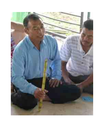
Fig. 3: Photo. A: Frequent burning has converted forests to grassland forcing forest elephants onto farmland. Photo. B: Young elephants are orphaned after being separated from family groups, during human-elephant conflict events. Photo. C: National Park and ALeRT Rangers install camera traps to survey fauna and identify poachers. Photo. D: Local farmers and project managers use a talking stick as a device to assist communication, during community meetings to discuss elephant/human conflict.